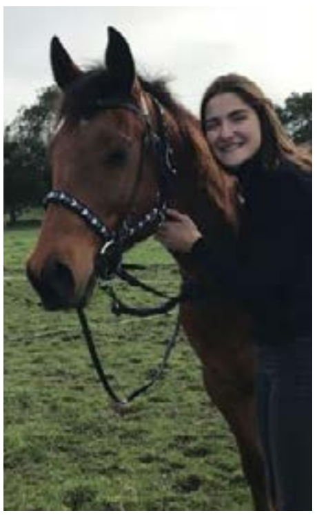
Bo the horse

I was really lucky with my host family and my host sister from Italy. The host parents wanted to show as much of the country as they could. One day, for example, we went to Curio Bay where we could swim