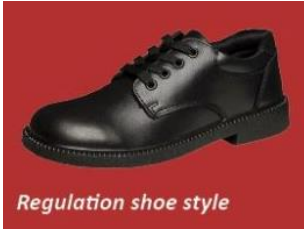
Regulation shoe style